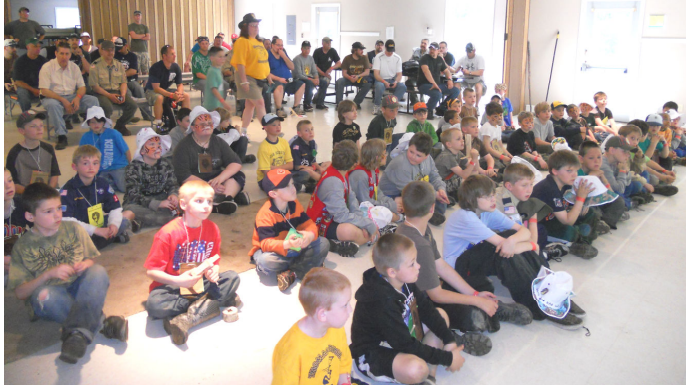
Scouts Watch Animal Show