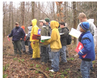
Forestry Merit Badge