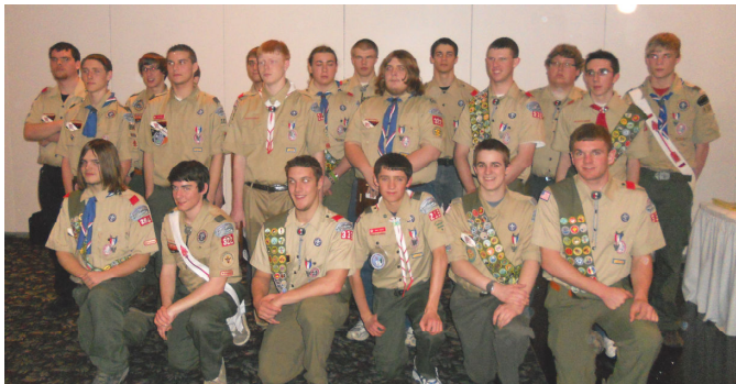
2010 Eagle Scouts Honored at Annual Dinner