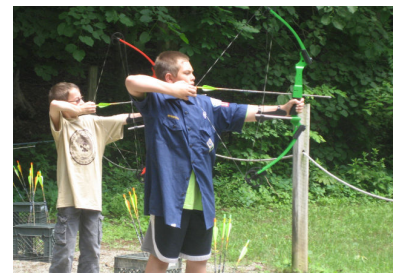
Scouts learning new skills during this year's Webelos Weekend