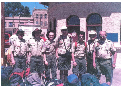
Train Station - Raton, New Mexico

Our Scouts had a great time. They learned a lot about nature, hiking, map and compass skills, hydration, weather, teamwork, leadership, patience, cooking skills, water purification, water conservation and many more things. The skills learned in the back country will last them their entire life.